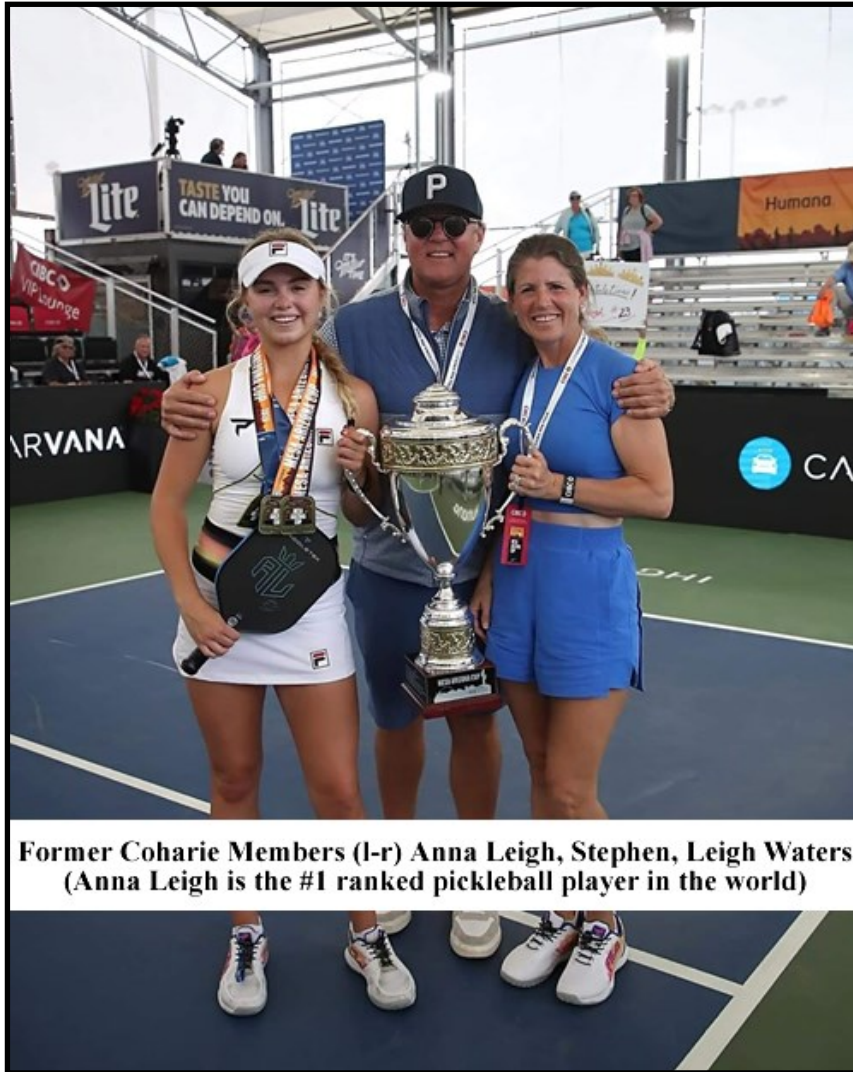
Former Coharie Members (l-r) Anna Leigh, Stephen, Leigh Waters (Anna Leigh is the #1 ranked pickleball player in the world)