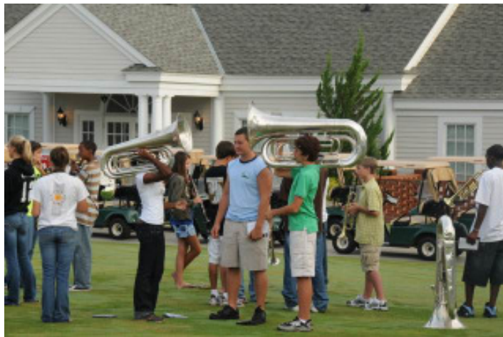
There was music in the air prior to last year's Clinton High Band Boosters golf event.

On Tuesday, Nov. 10, the Woodmen of the World superball tournament will be